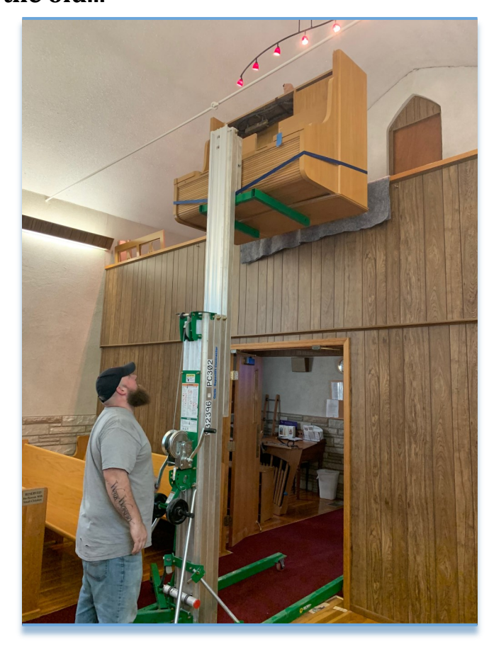
...and in with the new!